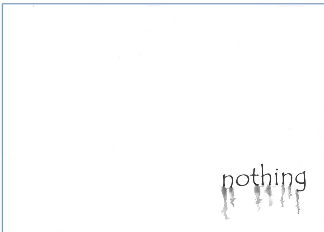
Figure 2. From Liruso, Susana (2022). Force, Fear, _____ .

to represent the sense of emptiness and void created after a fire causes significant destruction in a community. The place in which the text is located and its typographic features, such as form and size, are important aspects of the layout. Serafini and Clausen (2012) state that 'the typography of written language not only serves as a conduit of verbal narrative [...] it serves as a visual element and semiotic resource with its own meaning potentials'. (p.23) The shape of the word nothing conveys the action of melting and disappearing. In this way, the reader's attention is focused on the meaning potential of the word 'nothing' and prompts other meaning realizations, such as void, destruction and desolation.