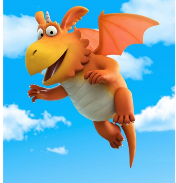
Figure 2. Character of Zog (animated movie) © Orange Eyes Ltd. 2018.