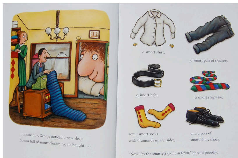
Figure 2: Second opening The Smartest Giant in Town by Julia Donaldson and Axel Scheffler, Macmillan Children's Books, London, UK.

Children first responded to the picturebook when the first double-page spread had been read, and the page was turned to reveal the second opening showing George peeking into a shop where two shop assistants were handling enormous socks and where on the right hand side different parts of clothing could be seen such as a shirt, a pair of trousers, a belt, a tie, a pair of socks and a pair of shoes (see Figure 2).