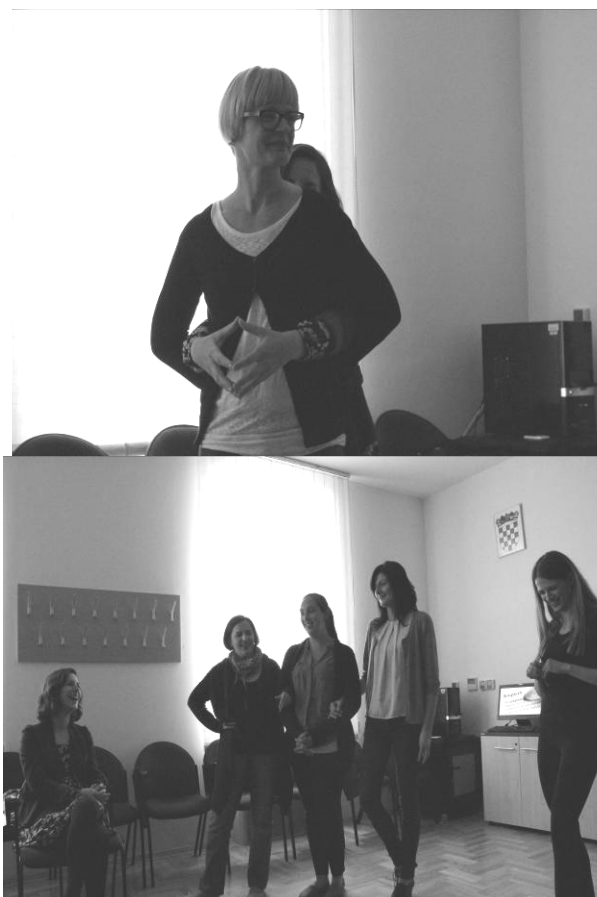
Figure 2. Arms-Through Expert and the Three-Headed Expert on witches

the antagonist of the tale that was read to them – Baba Yaga – telling the story of Vasalisa from her point of view. Some of the interview questions could be: Do you really eat children? How did you feel about Vasalisa's visit? What were you doing when Vasalisa arrived?