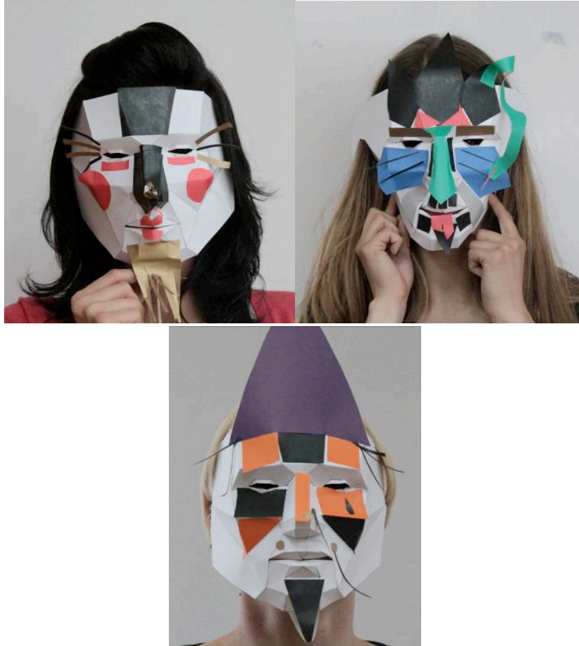
Figure 3. Selected examples of witch masks

beginning to the end of the workshop and whether the experience of playing this character resulted in any intra- and interpersonal insights.