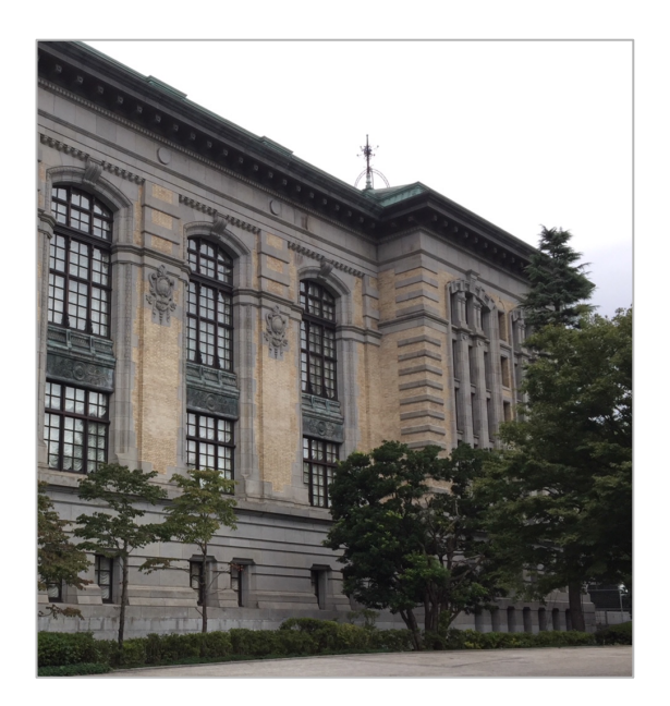
Figure 1: The International Library of Children's Literature, Tokyo

This statement, from the Japanese Act on Promotion of Children's Reading, can be found in the mission statement of the International Library of Children's Literature (ILCL) in Tokyo (http://www.kodomo.go.jp/english/about/profile.html). This library lives up to its goals by providing an extremely fitting environment in which all children can enjoy the pleasure of reading. As the sole national library in Japan dedicated to children's books based on the Japanese National Diet Library Law, the ILCL aims to realize the philosophy that 'Children's books link the world and open up the future!' through supporting activities and research related to children's books by using its abundant domestic and foreign materials and resources.