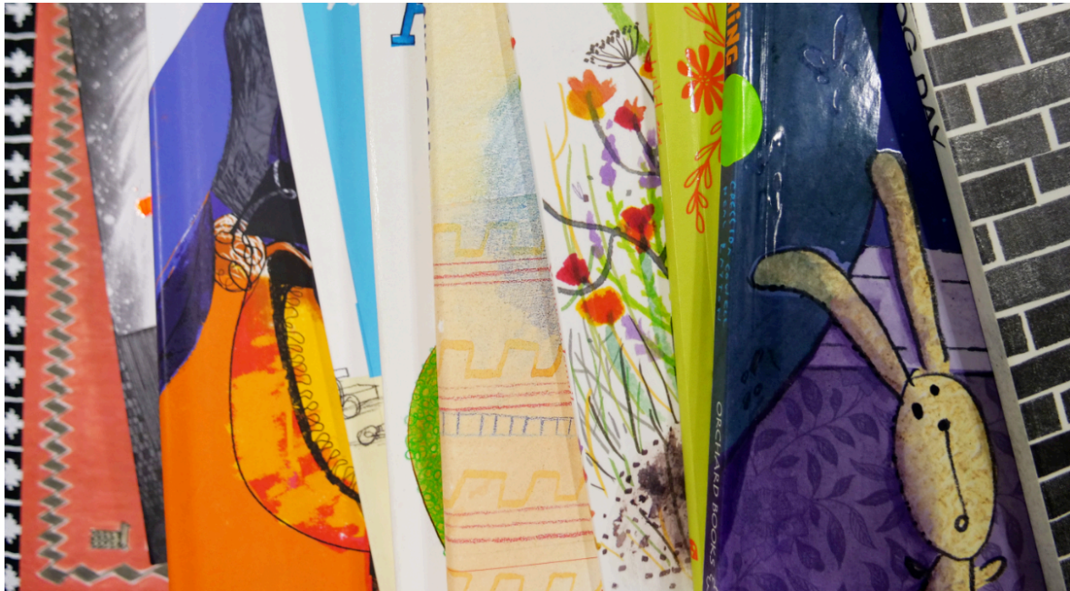
Figure 1: The Drawing Words website image

Drawing Words is an exhibition of children's picturebooks organised by the British Council and curated by Lauren Child, the UK's Children's Laureate (2017–2019). The exhibition features ten illustrators from across the UK whose work makes an important and original contribution to contemporary British picturebook illustrations. Each illustrator uses different techniques to tell stories that show new perspectives on the world around us.