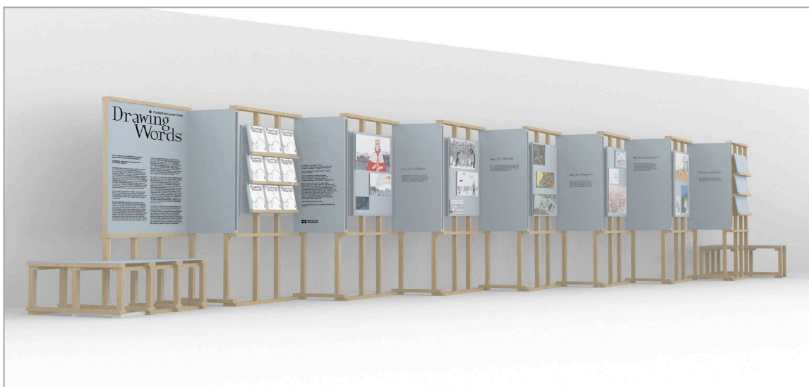
Figure 2: Drawing Words on display